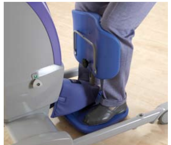
The footplate provides safety and stability, while the Pro-Active Pad allows natural flexion of the ankle.