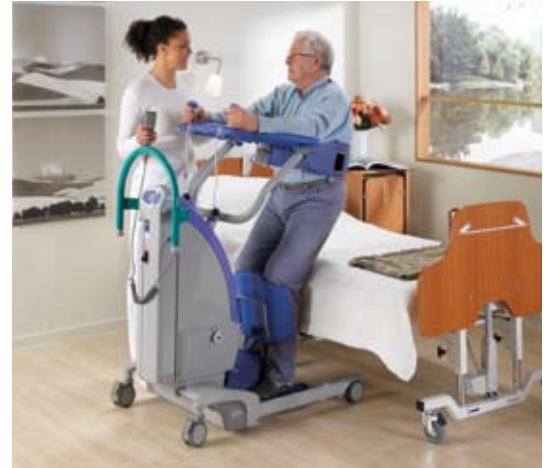
A single carer can manage transfers, safely and efficiently.

The sling is an integral part of the Comfort Circle, and a range of solutions is available to suit specific needs. In addition to the basic standing sling, a special BOS/EPS sling enables standing in a more upright position, which is more favourable for rehabilitation. The transfer/walking sling supports residents who need to be transferred in a seated position, and is also ideal for walking exercises.