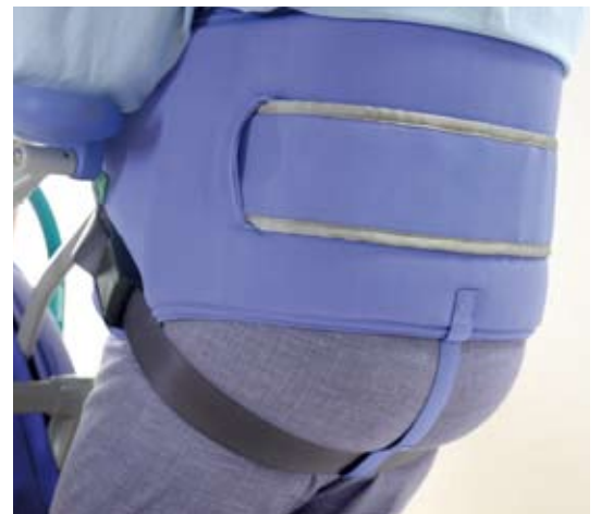
Supporting a more upright standing position makes the BOS/EPS sling ideal for rehabilitation.