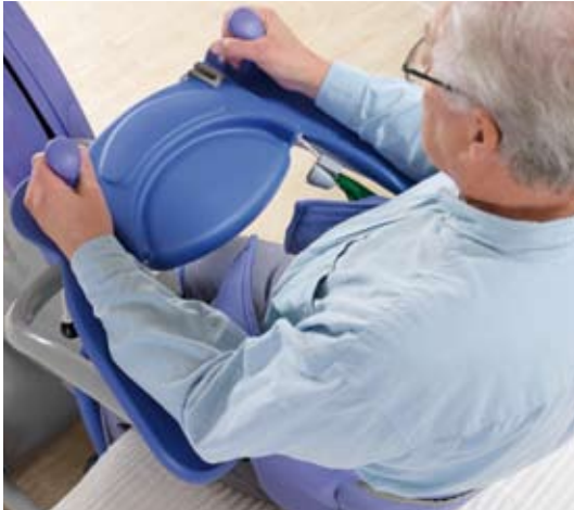
The Arc-Rest offers excellent support and promotes a sense of security.