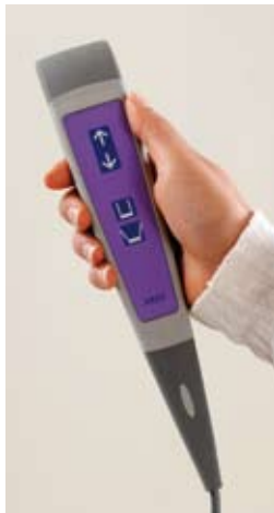
Dual controls. Handset or mast panel control? The carer can choose the most convenient control according to the situation.