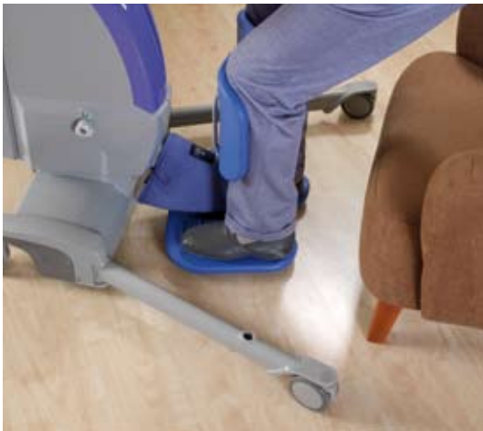
For transfers, the powered chassis can be opened for optimum access.