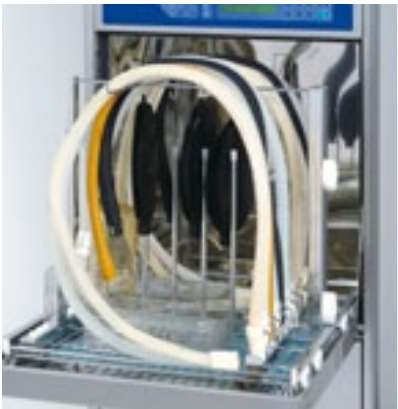
AN wash cart