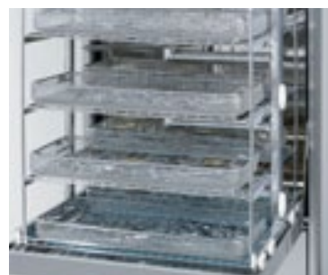
Getinge 46-4 – for surgical departments and smaller central sterile supply departments, items on four levels.