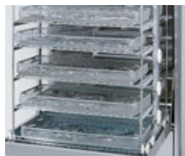
Getinge 46-5 – for larger surgical instrument sets and central sterile supply departments, items on five levels.