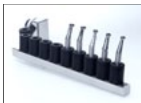
DENTAL BAR Equipped with 10 injectors for hand pieces. 5 for hand pieces with an approx. outer diameter of 16 mm and 5 for hand pieces with an approx. outer diameter of 20 mm. Fine filter is included. (Hand pieces in pictures not included) Art. no: 501261200