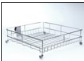
BASIC CART w. BLIND DOCKING Chosen at configuration.