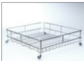
BASIC CART Chosen at configuration.