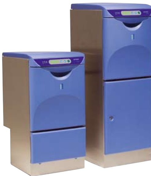
The Getinge 1200 is available in two different heights: 870 mm (under-the-counter model) and 1255 mm.

If vertical space is limited, there is also a convenient under-the-counter model.