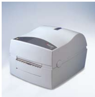
The GS57 can be connected to an external printer (available as an accessory) and computer for printing text on the bag. It can also be linked to a central documentation system.