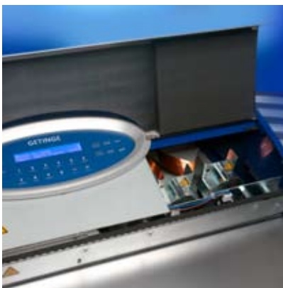
Easy to change the ink cartridges.

Each rotary sealer is tested in accordance with EU safety norms. They are validated and shipped with a certificate, operating instructions, technical information and a list of spare parts.